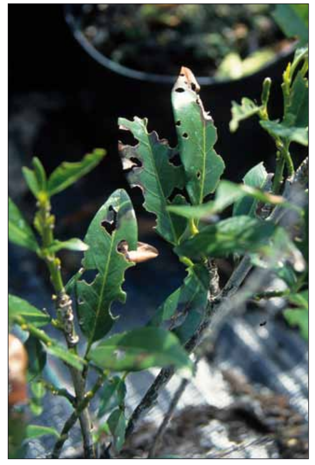
2 Leaf spots eventually drop out to give leaves a ragged appearance