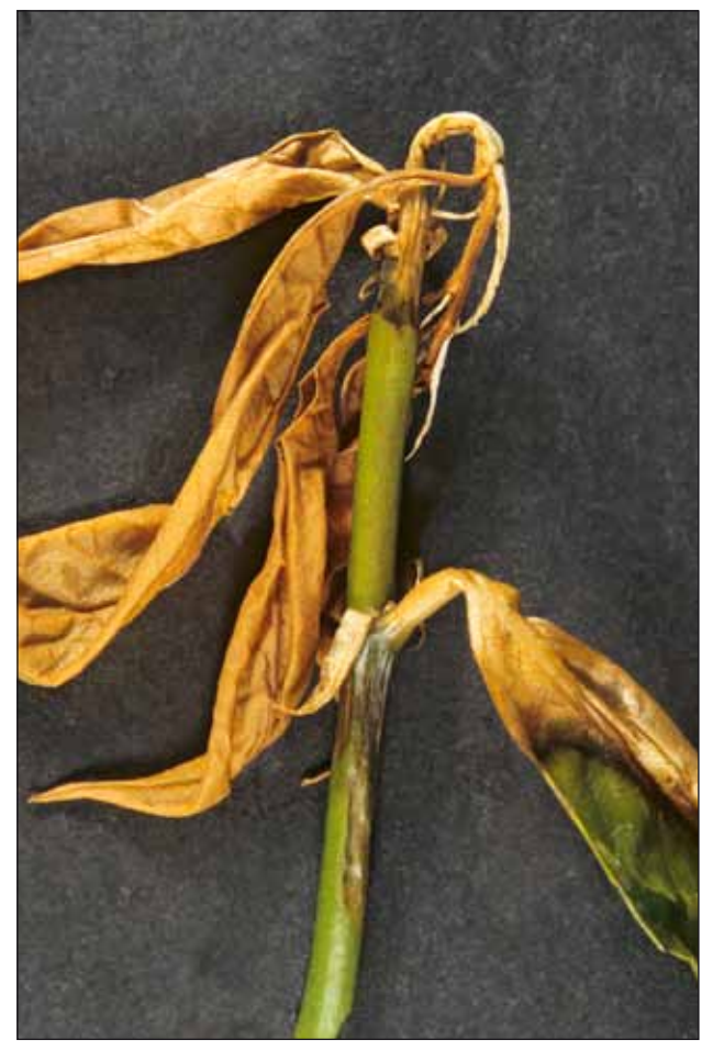
3 Shoot dieback caused by a combination of frost and Pseudomonas syringae pv. syringae