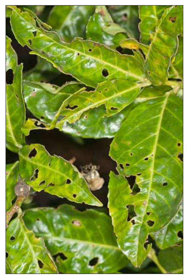
4 Shot-hole symptoms on P. laurocerasus 'Rotundifolia' caused by powdery mildew