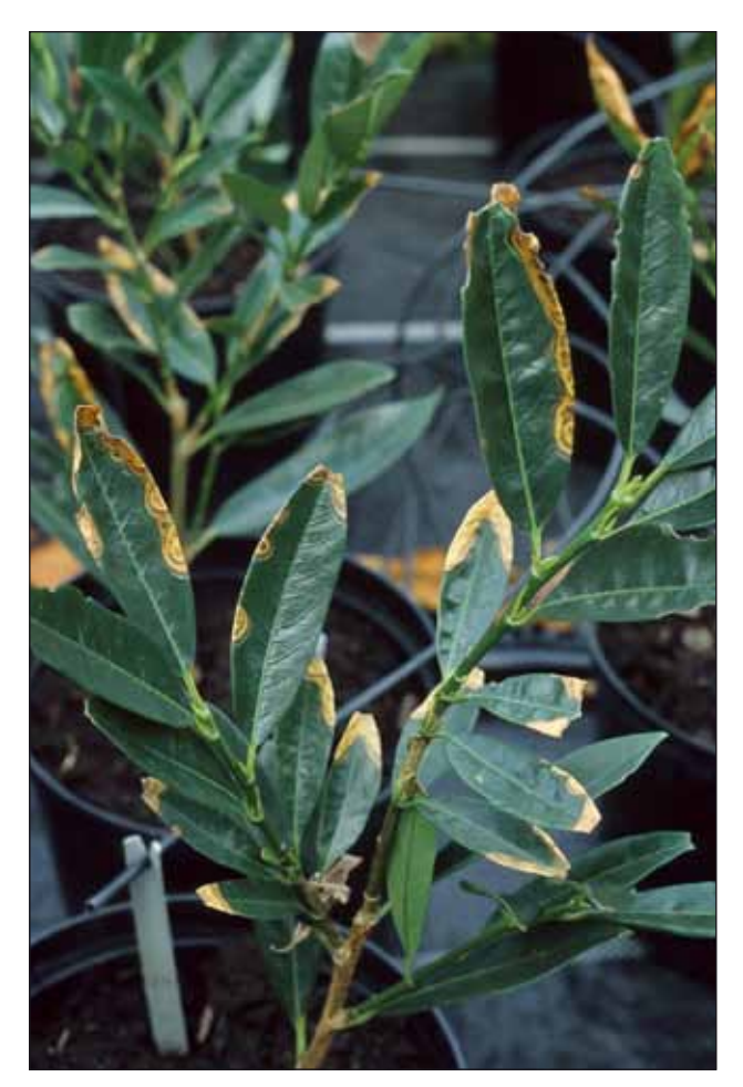
5 Marginal leaf necrosis can be a physiological problem